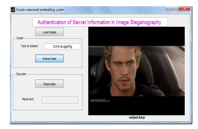
Fig 4: Watermaked Image